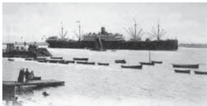
The Bulgaria @1904 Pasquale Gabrielle Caruso's Ship to the New World!